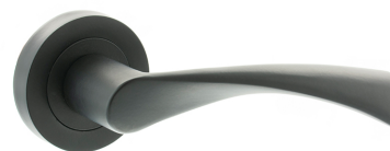
Product Finish Pictured: Matt Black